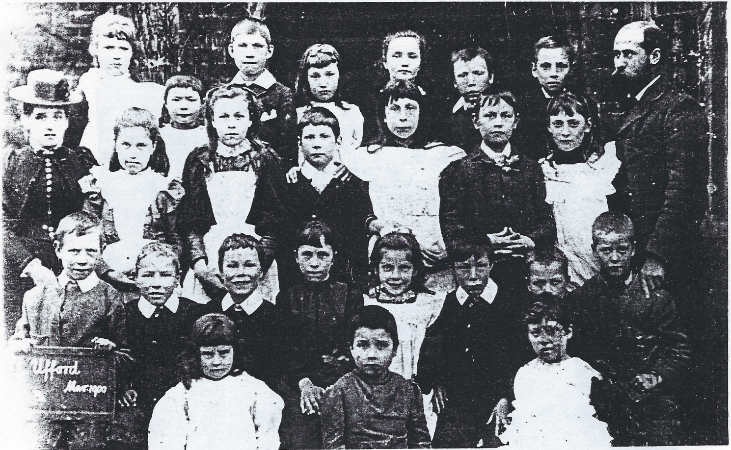
THE CLASS OF 1900