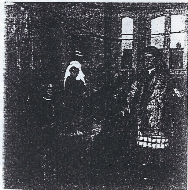
NATIVITY SCENE WITH DONKEY 1973